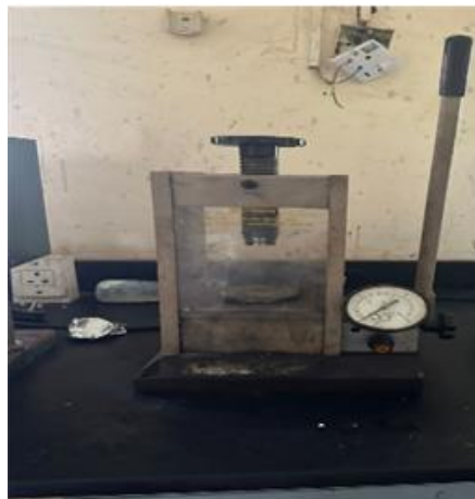
Fig. 1. Manual press machine used for compressive strength.